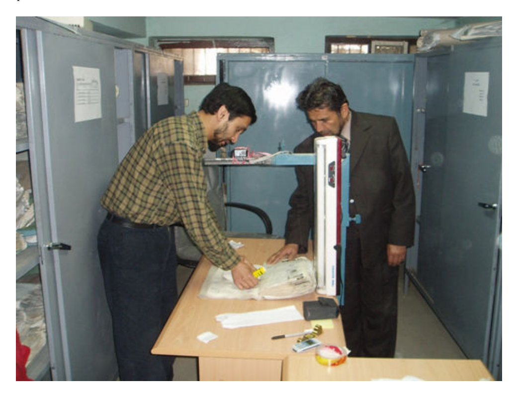
Figure 2: One of USAID/LTERA's reorganization teams digitalizes deeds in Kabul.

The property adjudication and registration process must be streamlined or retooled. As initial steps, the USAID LTERA Project is 1) reorganizing the land documents stored in the provincial Makhzans, and 2) is establishing a process and capability within the court system to create electronic copies of existing land documents, in order to both protect the documents and prevent forgery. Remaining steps that will be addressed related to the property adjudication and registration process include 1) reducing the time and costs involved in registering property, 2) establishing a process and capability to detect fraudulent deeds, and 3) upgrading the quality and precision of the information that is recorded.