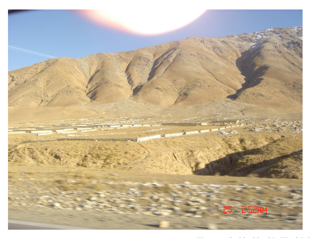
Figure 4: Grabbed land in Wardak Province.

Occupants of houses with cloudy legal issues fall into two categories. The first constitutes de facto owners of property who have bought land or a house from legal owners but did not fulfill the legal formalities required to formalize ownership. The transaction was legal but the legal formalities required to obtain a legal deed from the competent court were not completed. In many instances, buyers and sellers conclude customary agreements based on good faith and traditional norms and disregard the need to formalize the sales transaction in a competent court. Many Afghans perceive that a customary deed suffices to prove ownership of their property, especially when the original owner holds a formal document.