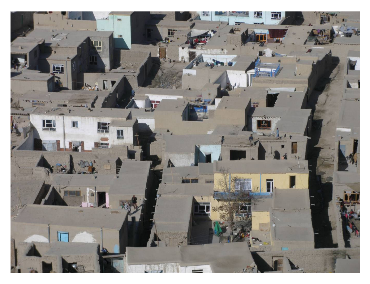
Figure 3: An informal settlement in Kabul.

In the context of addressing tenure issues in informal settlements the above classification is of little help because it totally disregards the varying legal sub-divisions of occupants of informal properties. Therefore, classifying settlements with respect to tenure arrangements is imperative for appropriately addressing the specific land tenure problems that are prevalent in different types of informal settlements. Based on the mode of land acquisition, informal settlements can be classified in four categories: squatter settlements on public lands; settlements where most houses were built on privately owned land; settlements where most houses were built on grabbed land or land bought from land grabbers; and settlements where there is a murky legal situation.